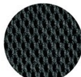
MESH SHOULDER STRAPS