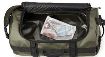
WATER RESISTANT ACCESSORY CASE CAN CLIP ONTO 2 OPTIONAL AREAS