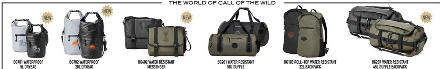
BG701 WATERPROOF SL DRYBAG