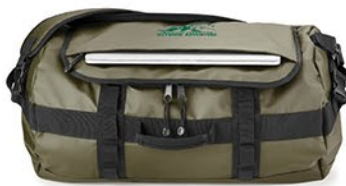
EXTERNAL QUICK-ACCESS WATER RESISTANT LAPTOP COMPARTMENT